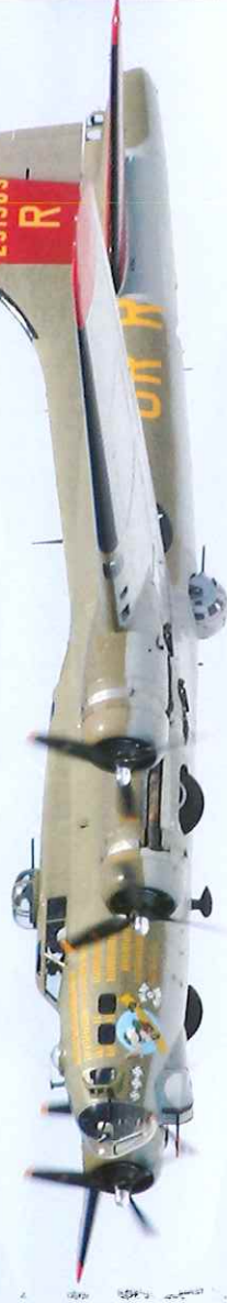
B-17 FLYING FORTRESS